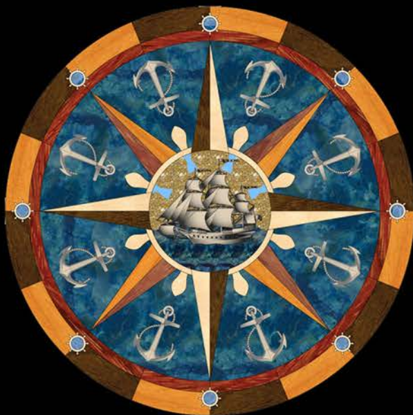
VOYAGER COMPASS ROSE W/ ANCHORS