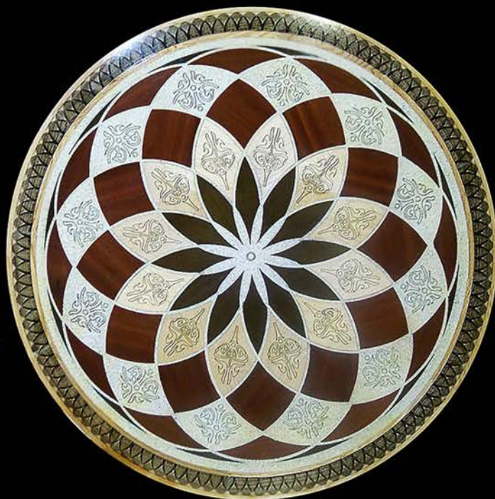
LOTUS EAST WOOD & LASER-CUT STONE COMBINATION

ALL WOOD CONSTRUCTION: CHERRY, WALNUT, MAPLE, PADAUK, WENGE, QUARTERSAWN WHITE OAK