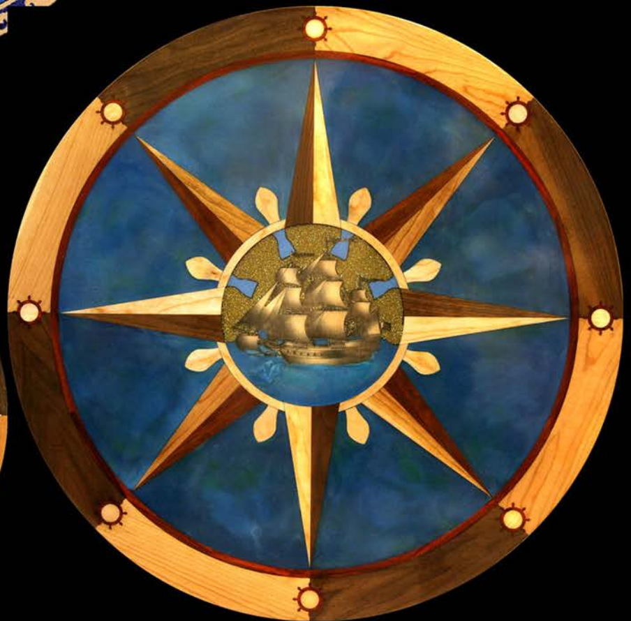
VOYAGER COMPASS ROSE