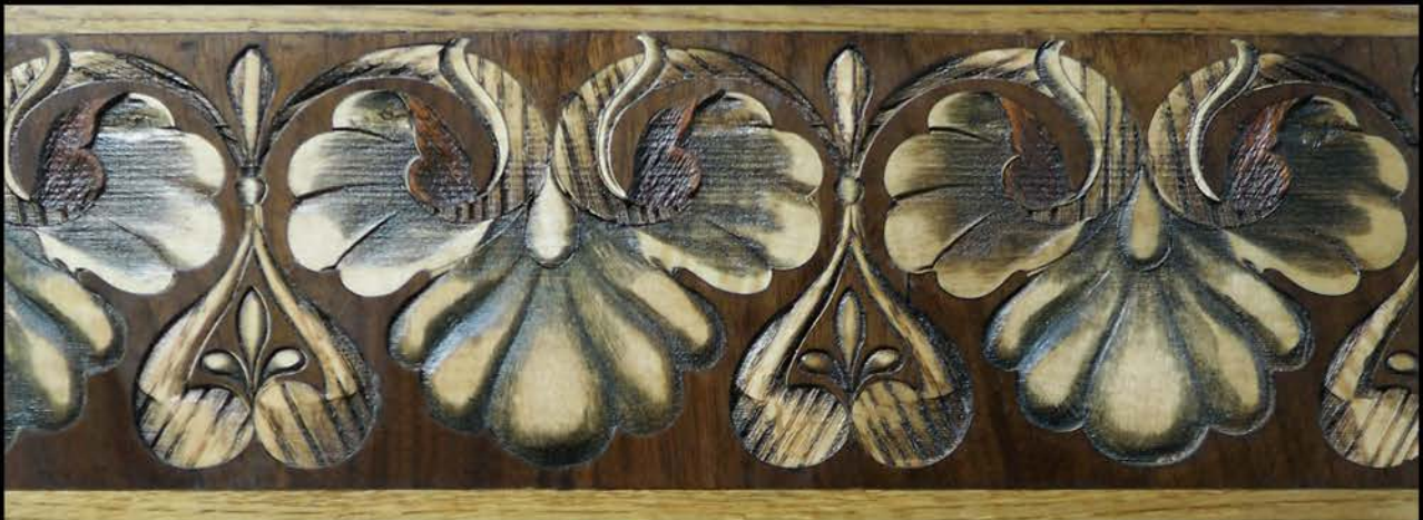
Inlay + Deep 3d convex carving