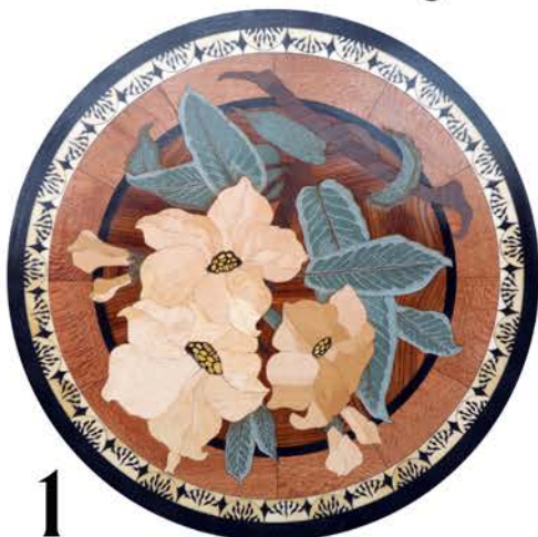
1 "Standard" inlay/marquetry (pieces placed next to each other, similar to a puzzle)

A "standard" design comes to life in 3D with carvings & gradient shadows