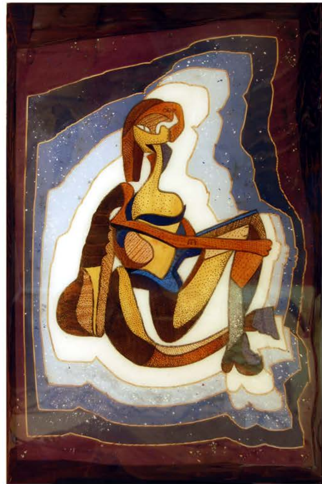
"BECOMING" Over lite Spanish wine our Client remarked "at 50 I realize I have lived life in a small box. I want be unpredictable. I yearn to be abstract." Our response is "BECOMING" where a rectangle becomes an abstract woman.