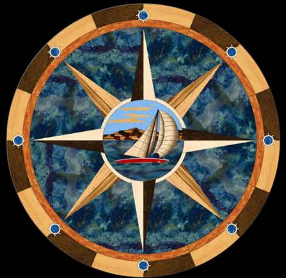
BAY SAILING COMPASS ROSE