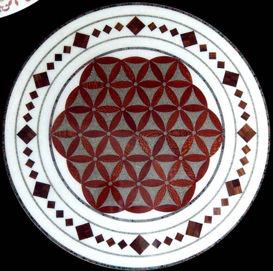
"Flower Of Life"