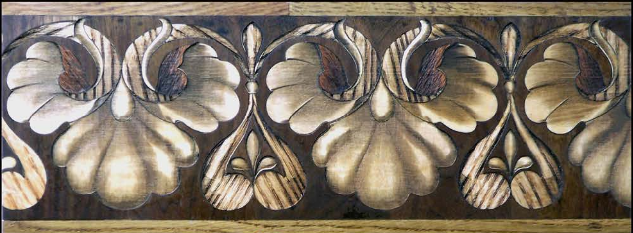
Inlay + Medium 3d convex carving