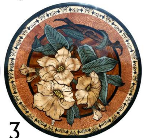
3 + "3D Gradient Shadow" (for truly realistic, photo quality 3D results)