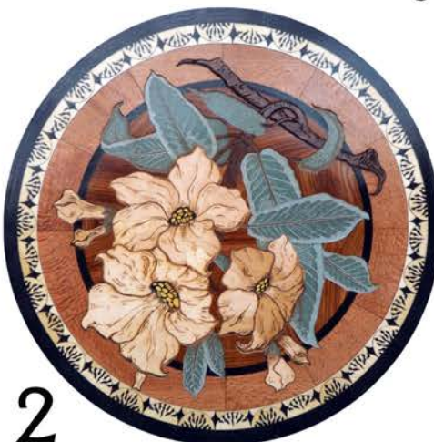
2 with "Definition Carving" (adds detail, movement and definition)