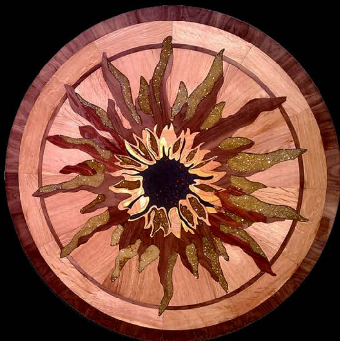
RISING SUN II