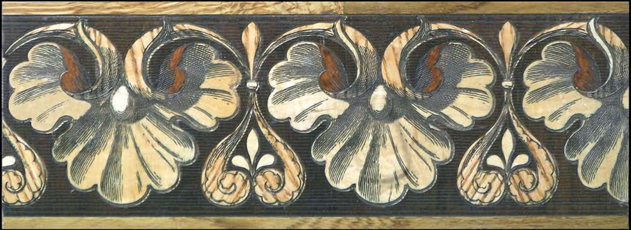
Inlay + Shallow line carving